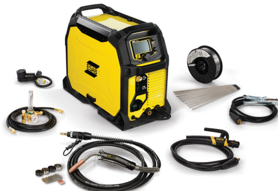
Rebel EMP 235ic complete package.

When choosing a top-performing welding machine you need top-performing ESAB Filler Metals. Learn more at esab.com/fillermetals today.