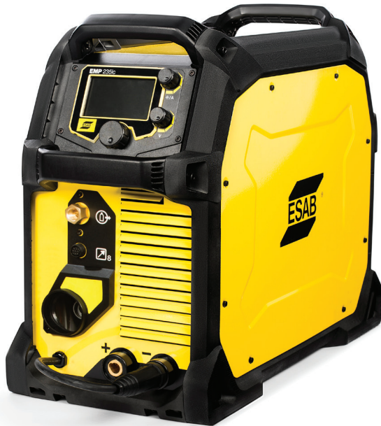
Rebel EMP 235ic